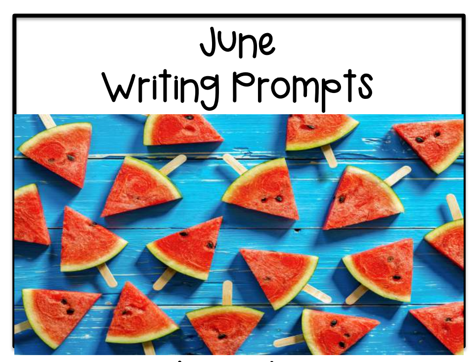
Task cards cover